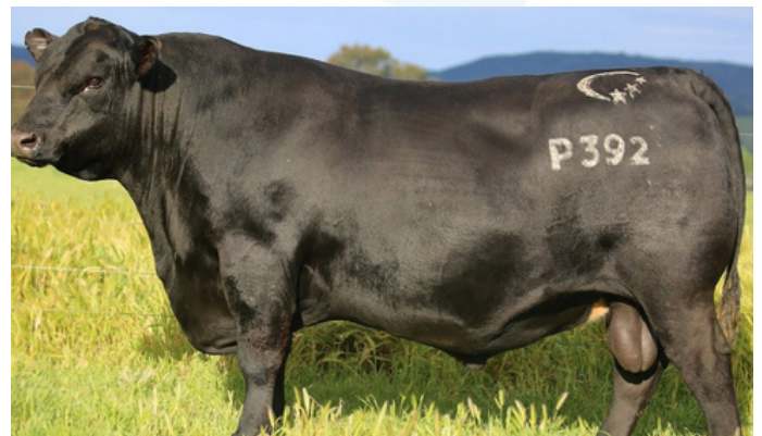
CLUNIE RANGE PLANTATION